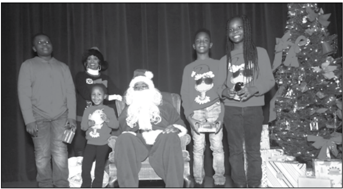
Pancake Breakfasts from years past