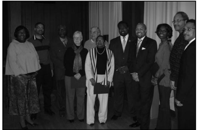
Welcome to the new board for RPIA!