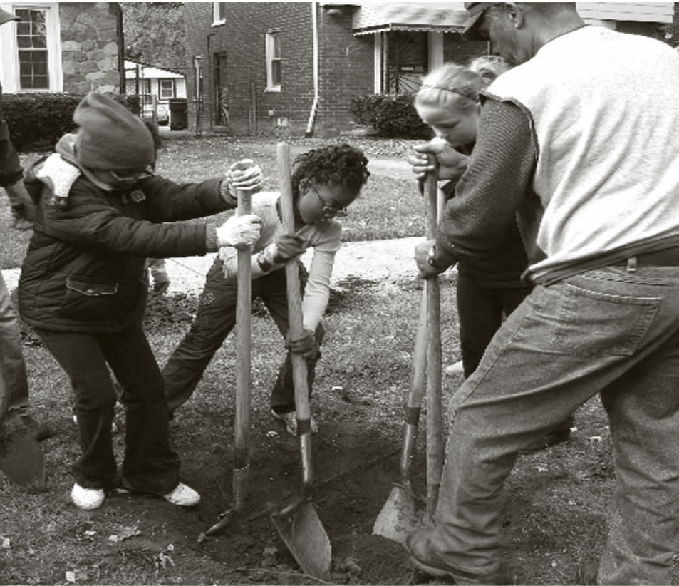
Girl Scouts and other volunteers, digging a hole.