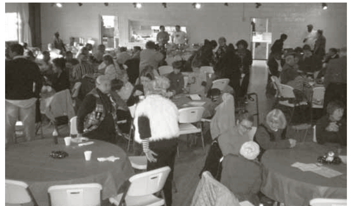
RPIA Pancake Breakfast