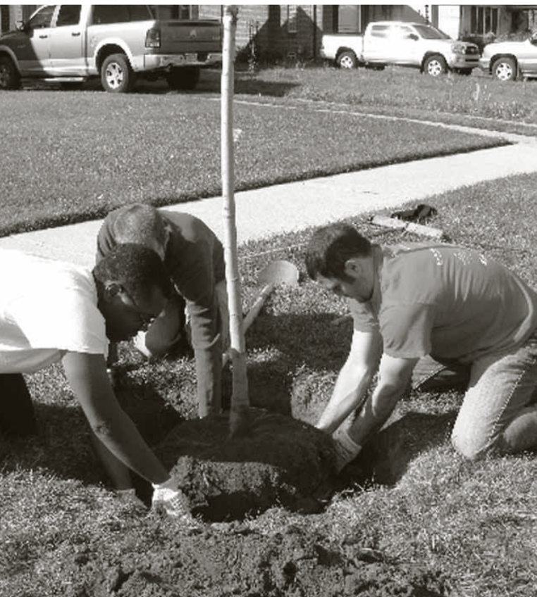
Volunteers work to get the root ball firmly anchored in the hole.