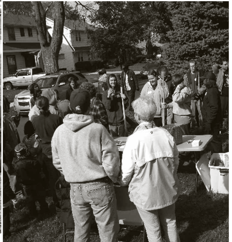
Registration of volunteers.