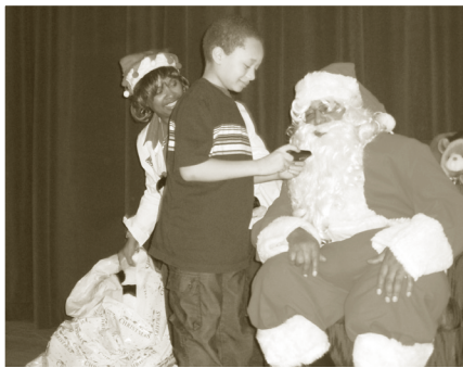
A youngster has his list for Santa on his phone.