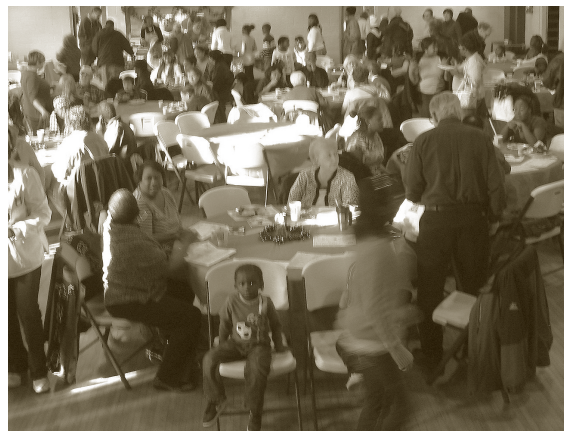
Neighbors enjoy breakfast and conversation.

See page 13 for more photos from the event!