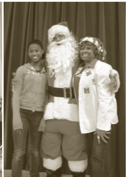
Santa with some helpers.