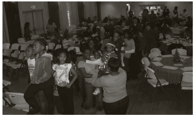
Waiting to visit with Santa.

If you weren't able to attend, make sure to join us next year!