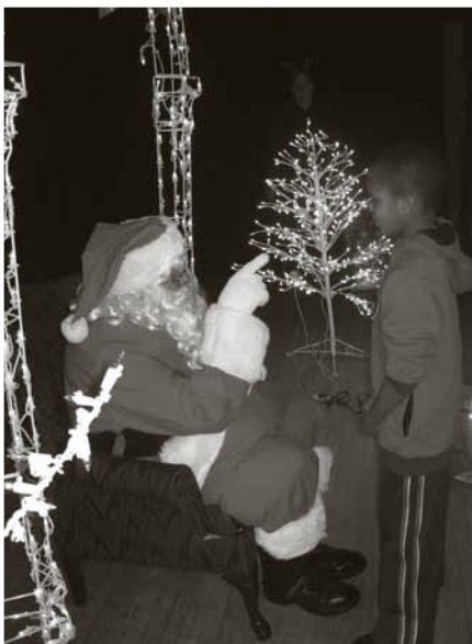
You'd better not pout!