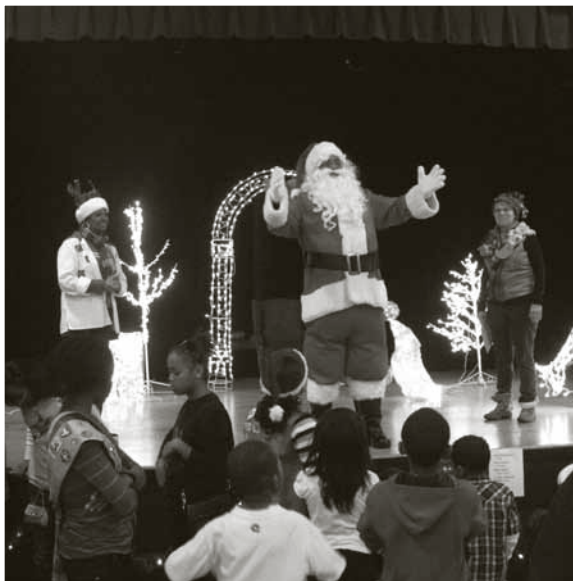
Santa welcoming the boys and girls.