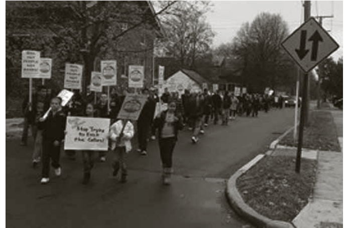
March on Bank of America at Ashton, November 10, 2012.