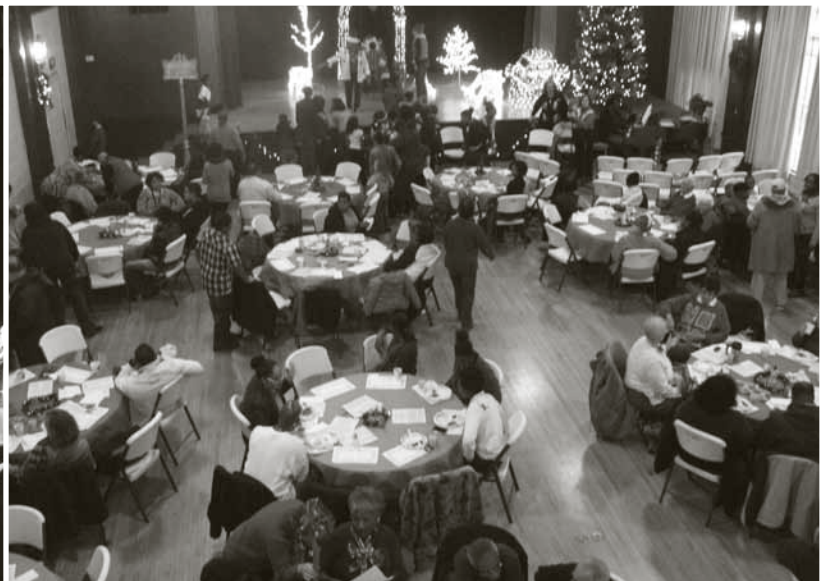
The Community House was festively decorated and bustling with activity!