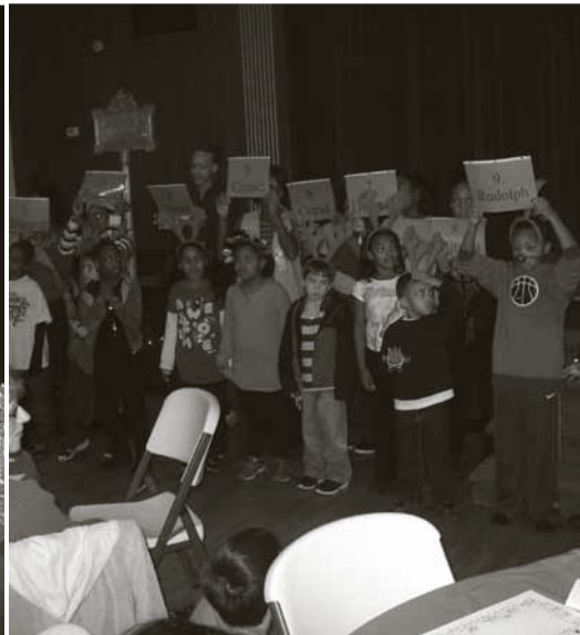
Ever popular -- Rudolph the red nosed reindeer.