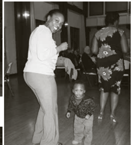
Never too young to start learning the Hustle