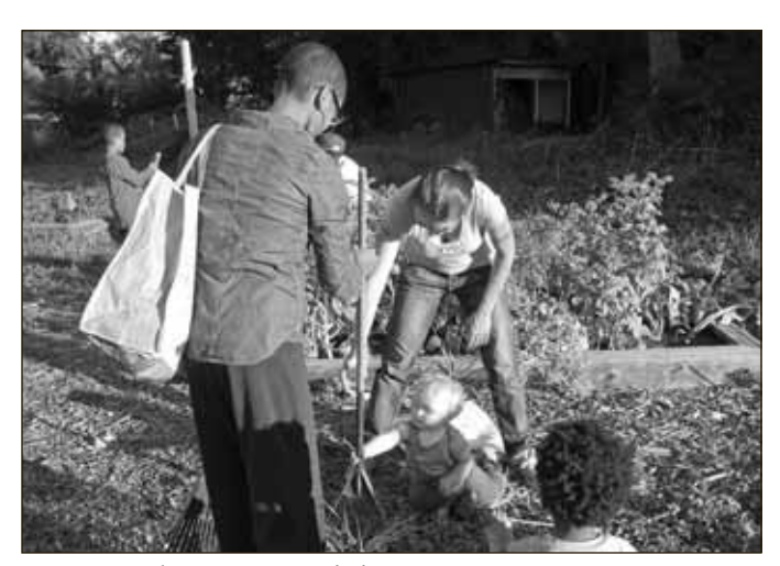
Future gardeners want to help, too.

Volunteers split up the food, which included raspberries, strawberries, peppers, kale, tomatoes, carrots, beets, potatoes, lettuce, broccoli, Swiss chard, onions, garlic, cucumbers, green beans, parsley and a few flowers.