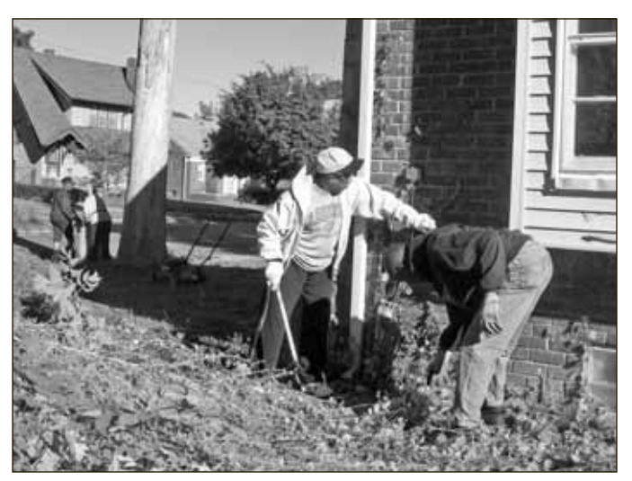
Neighbors tackle some weed trees growing next to the abandoned home.