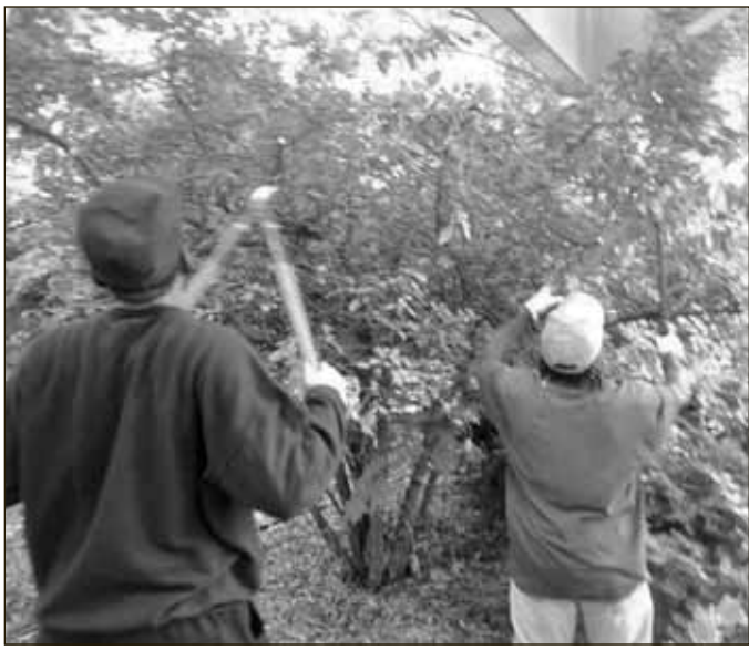
Volunteers with loppers begin to trim bushes.

The project will provide community residents and library patrons with a place of solace, contemplation and refuge within the library campus.