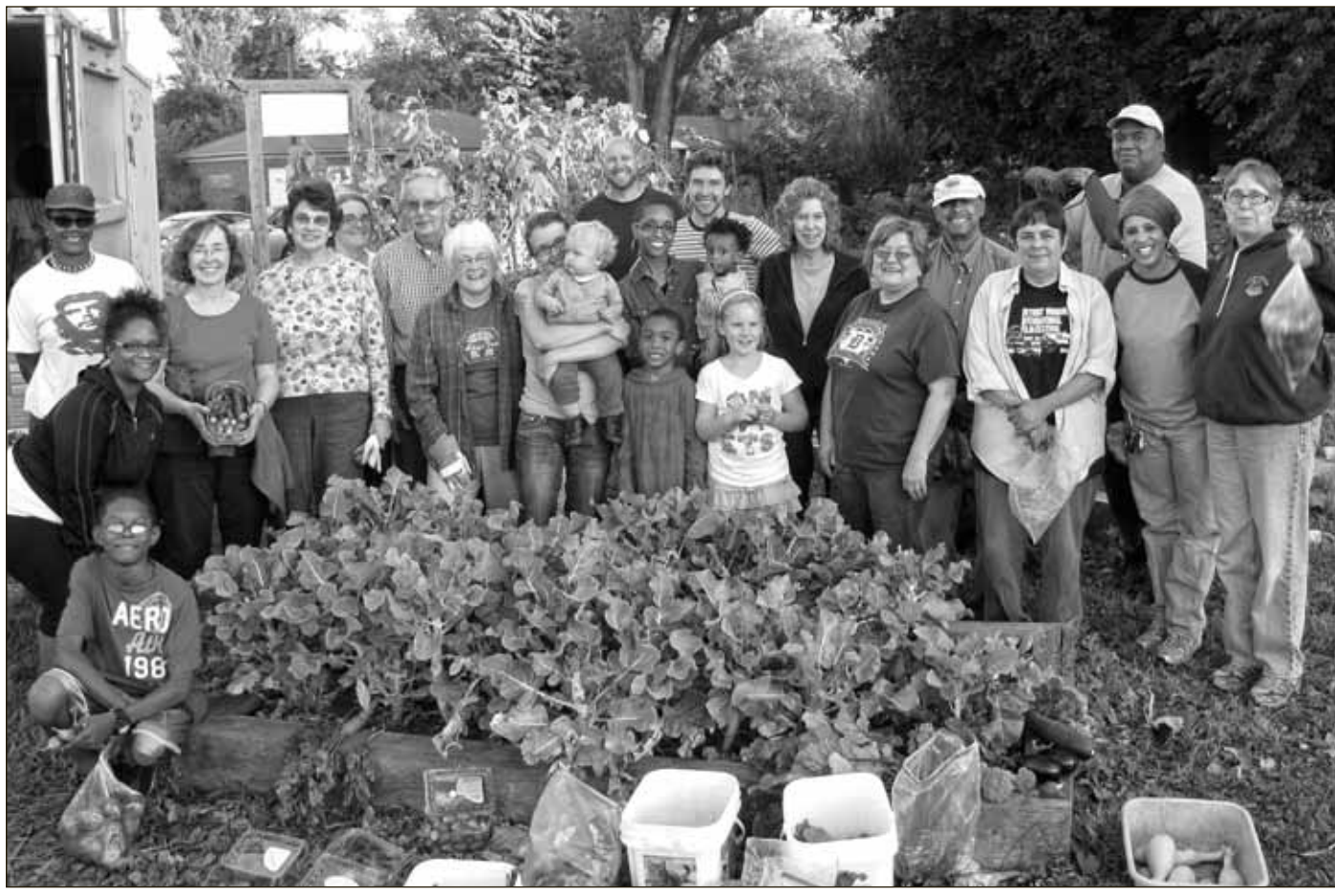
Community gardeners show off some of the bounty.