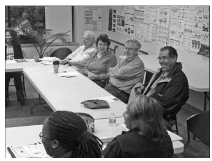
Radio patrol meetings aren't all business, there's a good amount of humor, too.

The next meeting is Tuesday, December 17 at 6:30 PM at the GRDC offices. It's the annual Christmas celebration and potluck.