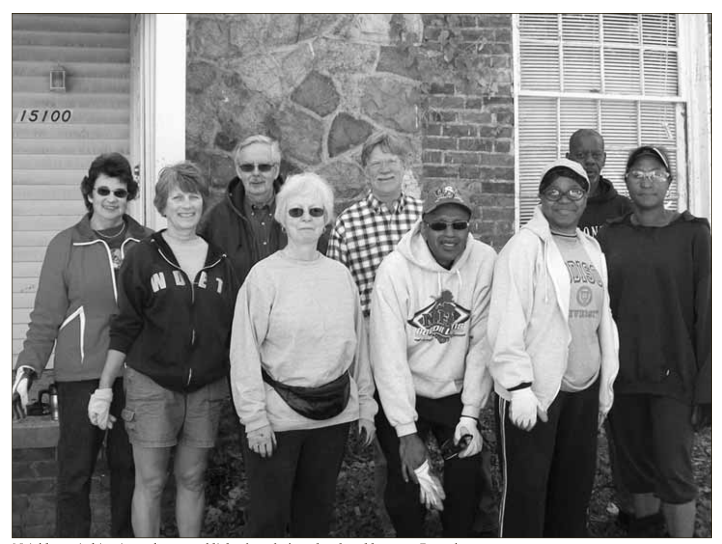
Neighbors pitching in to clean up a blighted yard of an abandoned home on Penrod.