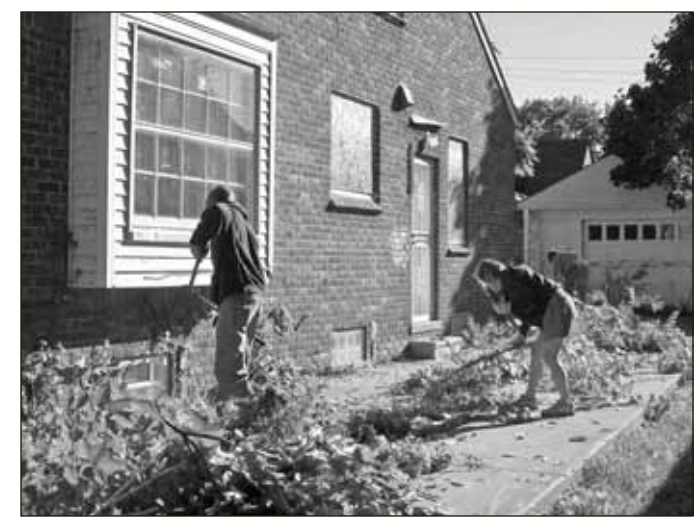
It's looking better already.