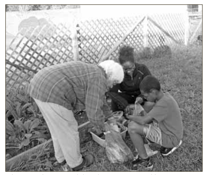
It's time to harvest and distribute some vegetables.

Another bountiful growing season is coming to a close at the Rosedale Grandmont Community Garden at Bushnell Church. Throughout the season, around 30 volunteers planted, watered, weeded, staked and harvested vegetables and fruit.