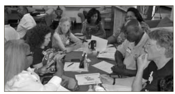
The Abandoned Property/Blight Committee focuses on strategies for a district-wide housing survey.