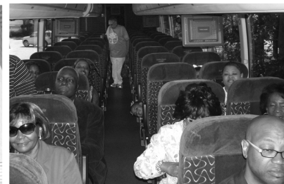
Residents begin filling the bus for the ride to the Detroit Institute of Arts (top). On left, the Rosedale group poses for a photo before entering the DIA for a grand tour.