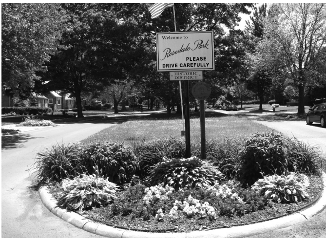
Great job on the island, Warwick (Midland to Keeler).

The Garden Bug, located on the corner of Stahelin and Grand River, is now offering to block captains or persons responsible for island maintenance, a special price for flats of flowers for $7, before July 8.