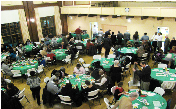
Over 100 residents packed the Community House for last year's banquet.