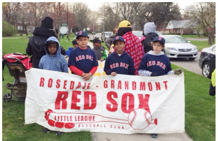
Kids on the minors Red Sox getting ready for Open Day

The season begins with Opening Day on Sat., April 30 and runs through June. Most games are played at Stoepel Park. For more information, send an email to rglitleague@aol.com