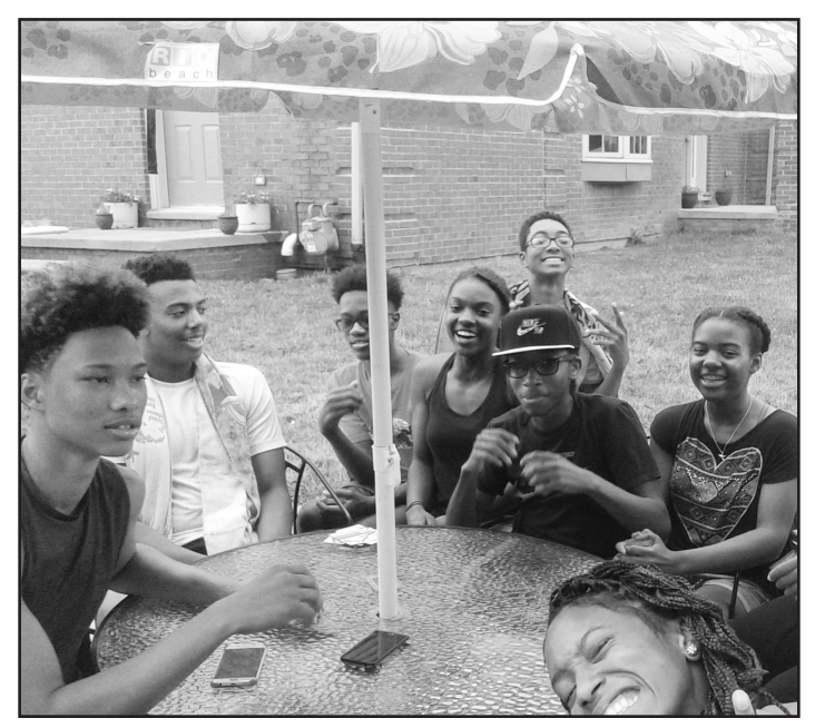
Young people gather at the 2016 Ashton Block Party.