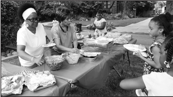
ASHTON | Fenkell to Chalfonte