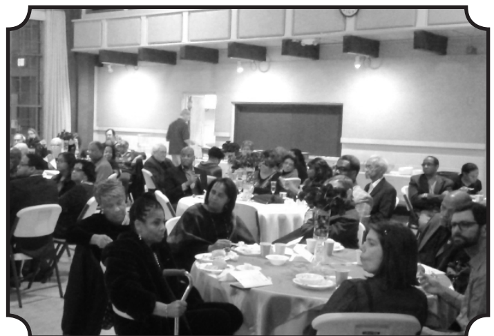
Residents, Family, and Friends gathered at the Community House to enjoy last year's Gala.