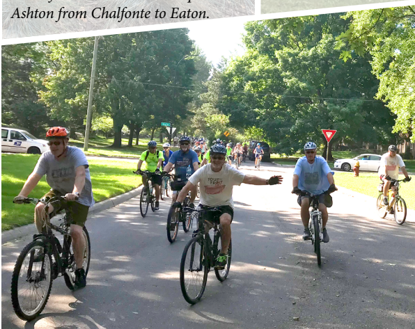
Neighbors gather on Warwick Street to cheer on cyclists as Tour De Troit rolls through Rosedale Park.