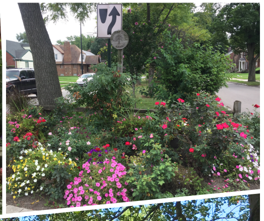
Beautiful blooms on Most Improved Winners' Circle block Ashton from Chalfonte to Eaton.