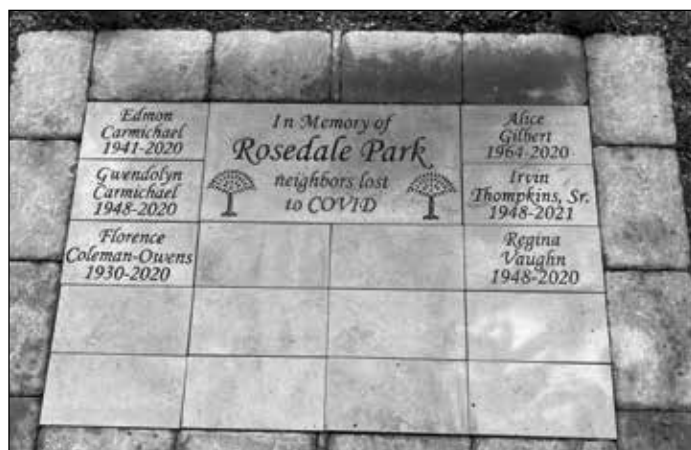
Rosedale Park's brick COVID Memorial at Rosemont Acacia Park.