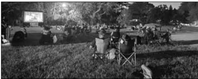
Grandmont Movie Night on May 26.

Our August Movie in the Park was postponed due to the vendor having a family emergency. It is now Saturday, Sept. 18 at 7:15 pm at Rosemont/Acacia Park, 14130 Rosemont. Stay in touch with our eBlast for updates.