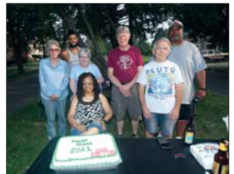
Let them eat cake on Faust (Chalfonte to Eaton).